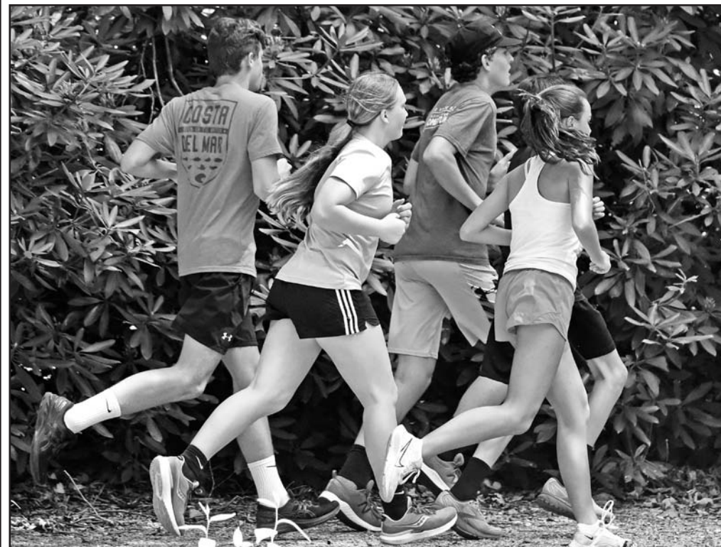
UCHS cross country runners take a warm-up lap ahead of last week's practice at Meeks Park. Officially sanctioned GHSA practices began Aug. 1, but coach Paige Dyer encouraged her athletes to run on their own at least twice a week over summer break.