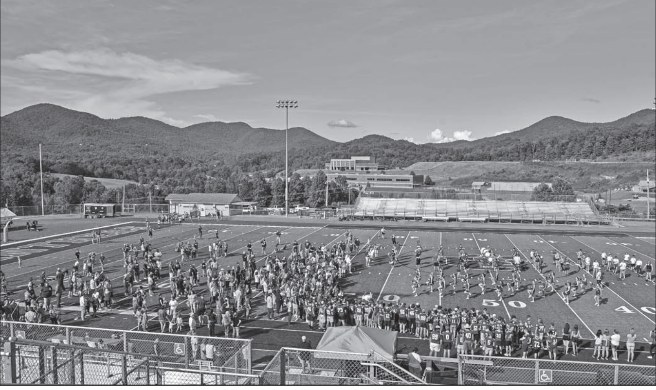
Union County football's annual Meet the Team event was another resounding success, attracting hundreds of Panthers fans to Mike Colwell Memo-rial Stadium on Thursday, Aug. 4 to support the football, cheer and band programs.